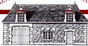
CUVIERIE DU XVII e SIÈCLE